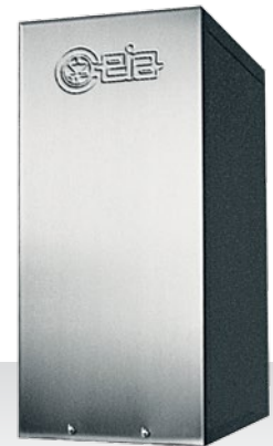
POWER CUBE 90/200 POWER CUBE 180/200