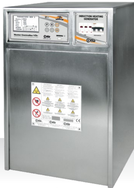
POWER CUBE 360/200