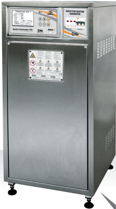
POWER CUBE 720/200