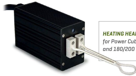
HEATING HEAD HH17C for Power Cube 90/200 and 180/200

The use of innovative technology and latest-generation components places the 200 series generators in a class of their own in terms of performance, power output and operational cost.