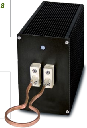
HEATING HEAD HH19 for Power Cube 720/200

* Inductors shown in the pictures as example only