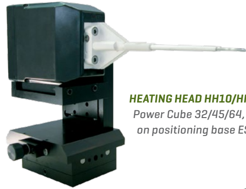
HEATING HEAD HH10/HH11 for Power Cube 32/45/64, mounted on positioning base ES35

The use of innovative technology and latest-generation components places the 900 series generators in a class of their own in terms of performance, power output and operational cost.